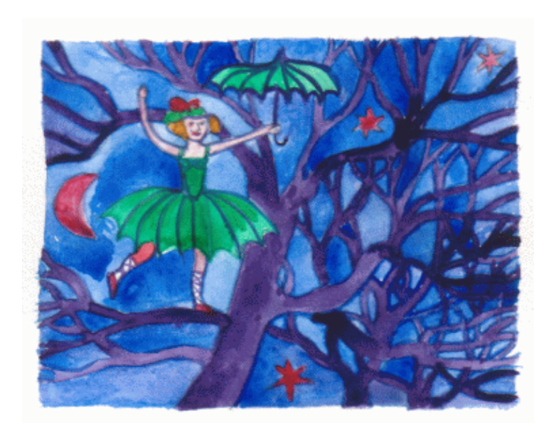
The spirit of self-help is the root of all genuine growth in the individual. Samuel Smiles, Self-Help 1859.

The planet Pluto challenges us to transform our lives by clearing out our old habits to make way for the new, more rewarding ways of living. The process isn't necessarily an easy one, as most of us cling tenaciously to the comfort offered by habitual patterns, and are rather scared of new paths. Pluto shows us in which areas of our lives we need to grow, and to a certain extent whether we're likely to find the process of growing painful or joyful.