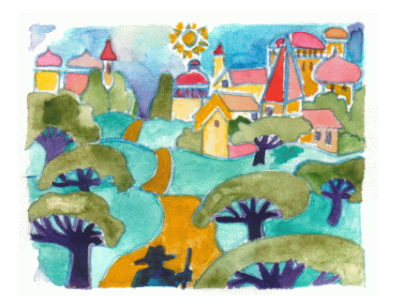
If you would hit the mark, you must aim a little above it; Every arrow that flies feels the attraction of earth. Longfellow, Elegiac Verse 1880.

Just as the Sun is the centre of the Earth's Solar System, so does the Sun play a vital role in your life on earth. Your life goals are linked to your Sun - its zodiac sign and its position in your chart. Contrary to popular belief, the Sun isn't the only planet to be considered in a person's chart, but it is an important component. The Sun gives you an indication of how you can shine in your life. You will feel truly alive when you're living the traits indicated by your Sun. Therefore it's likely that you will spend much of your life on a journey to self discovery, aiming to incorporate these traits into your life. Understanding the energy of your Sun is a good starting point to understanding yourself and your purpose in life.