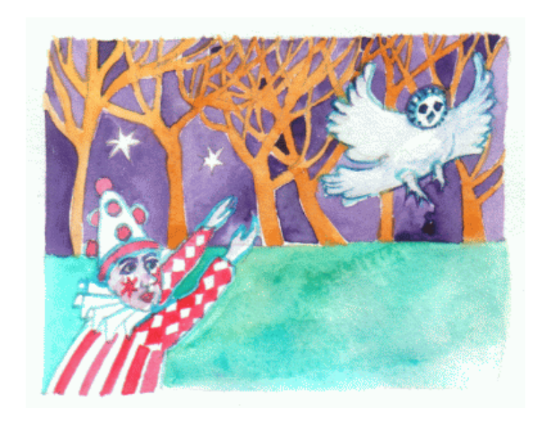
Dimidium facti qui coepit habet: sapere aude. To have begun is half the job: be bold and be sensible. Horace, Epistles 65- 68BC.

Mars is the planet that tells us about our assertion and drive. It tells us what motivates us and what desires drive us most powerfully. Are we ambitious for professional power, or do we desire a meaningful relationship? Do we pursue our desires aggressively? Or do we sit back, lacking the confidence to achieve our ambitions? These are the types of questions answered by the qualities of the planet Mars in our chart.